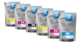
Advanced UltraChrome DS ink ships in cost-effective 1/1.1L packs

Epson is the registered trademark of Seiko Epson Corporation. All other names and company names used herein are for identification purpose only and are trademarks of their respective owners; Epson disclaims any and all rights. Specifications are subject to change without notice. Visit www.epson.com.au or www.epson.co.nz for the latest information.