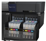
High capacity 15 / 18L CISS. Tanks can be refilled while printing continues